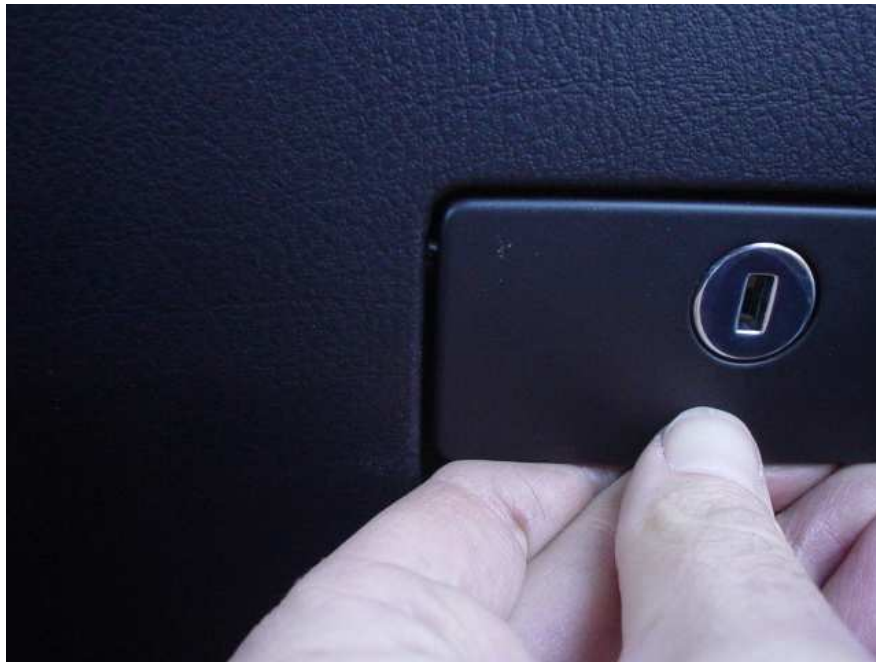
Figure 1 Typical Glove Box Latch

A recent automated assembly line for a plastic over-molded, spring steel, automotive glove box latch (see figure 1) was designed with a latch effort inspection station that required measurement very small forces in-process. However, the machine and operators can cause very high overloads as part of normal machine use. Thus the customer required a force sensor that was durable enough for the environment, yet sensitive enough for the required measurement.